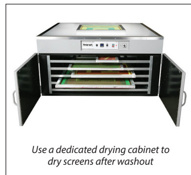
Use a dedicated drying cabinet to dry screens after washout

Screens can be dried either vertically or horizontally, whichever is the most convenient for production, but it is recommended that a dedicated screen drier is used for this post washout drying. After drying it is good practice to let the screens stand for at least 24 hours before printing as they will continue to harden and this will maximise their durability, this is especially beneficial for photopolymer stencils.