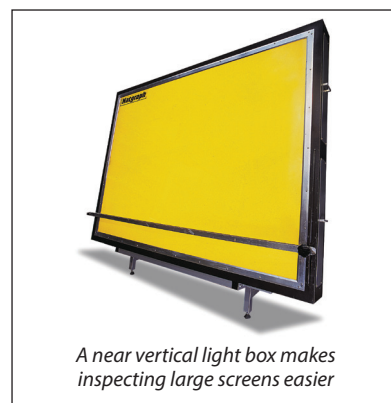
A near vertical light box makes inspecting large screens easier

The inspection must be with a backlight in order to pick up the smallest defects. Use a proprietary blockout filler, such as Regular Filler for all solvent based and UV curable inks. For water based inks, use a sensitised emulsion and remember to post-expose the screen to harden this emulsion. Large open areas can be blocked out using either an old credit card as a spreader, or a narrow coating trough. Spot out pinholes carefully with a retouching brush, but make sure that the surface is flat after application.