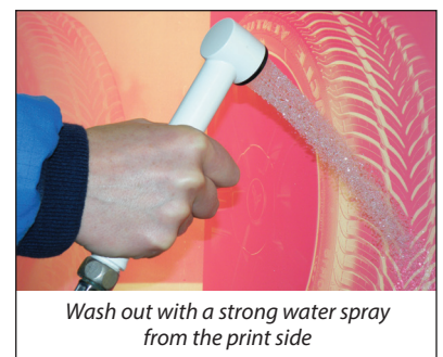
Wash out with a strong water spray from the print side